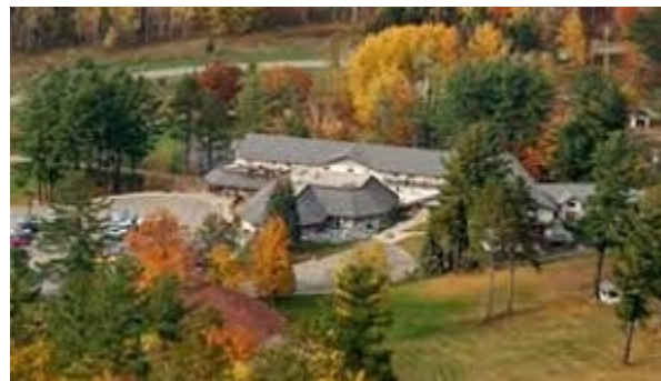
Pine Mountain in the Fall – An amazing venue for our Show!!