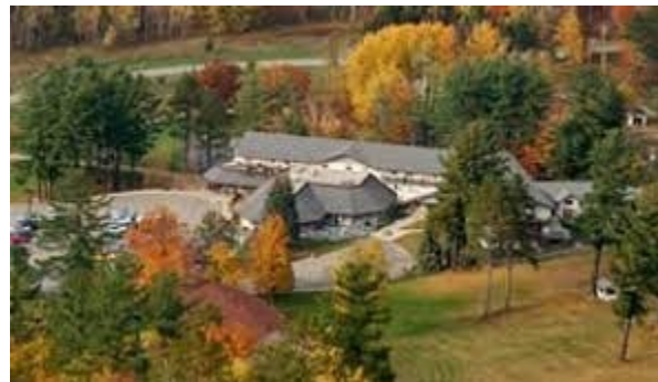
Pine Mountain in the Fall