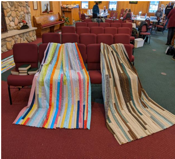
Mission Quilts getting done at Open Sew on January 4th