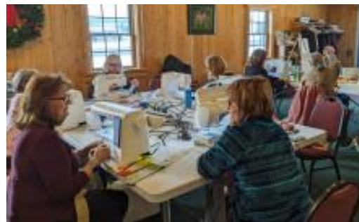
Members enjoying Open Sew – January 4, 2022

The WRQG website is up and ready for your visit. On the website you'll be able to check out the Calendar, learn about and RSVP for Programs (Gatherings page), find Newsletters, meeting Documents (agendas, minutes), Volunteer opportunities (Who We Are page) and more. Document loading is in progress, and photos will be added. Check out our website at wildriversquiltguild.org (and save it on your Favorites or Bookmark it.)